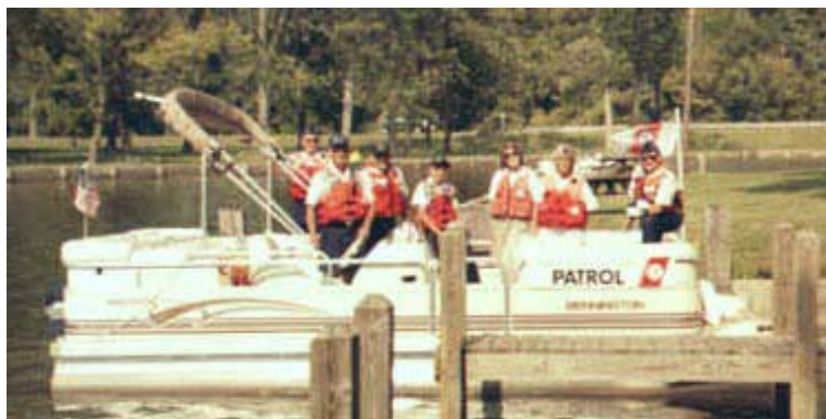
U.S. Coast Guard Auxiliary at Indian Lake. These dedicated volunteers are also CLAM volunteers. They save lives and lakes.