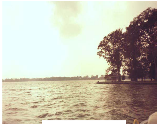
Indian Lake, Summer 2001